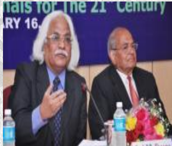
Discussion during C.K. Prahlad Lecture Series

Aided by the state-of-the-art infrastructure, DSM incorporates lectures, case studies, seminars, business games, simulation exercises, mini projects, unstructured group works and field visits in its teaching methods. It is done in an interesting and encouraging manner for the purpose of imparting knowledge in the minds of the students.