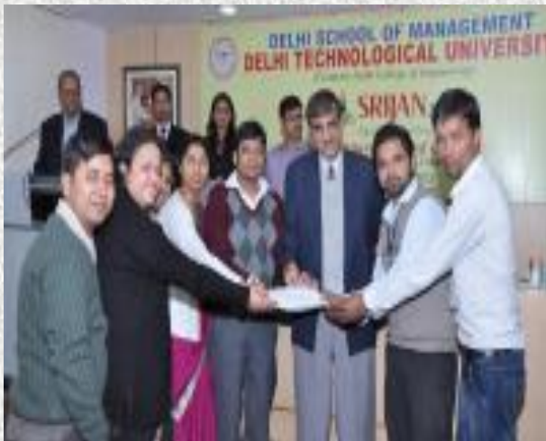
Prize Distribution Ceremony of Srijan- 2013

The academicians at DSM are a veritable treasure of learning and erudition. With a mature lineage of consultancy and research behind them, this exclusive group of academicians is responsible for grooming talents into performing prodigies.