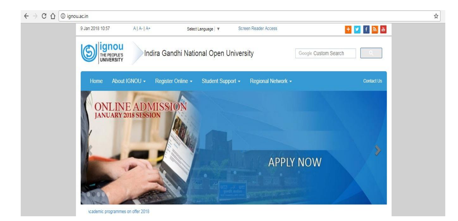
Fig. 1: Web page of IGNOU Website

You can get the details of information about IGNOU from the website. If you face any problem or have any doubt, you should e-mail to the program coordinator.