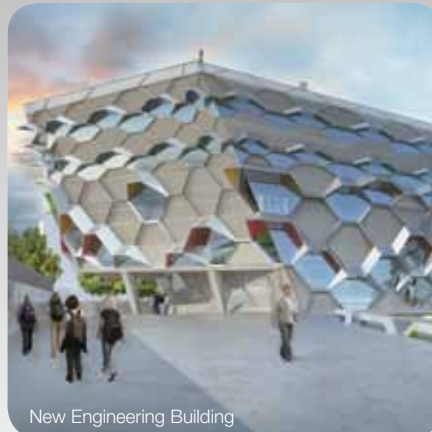
New Engineering Building