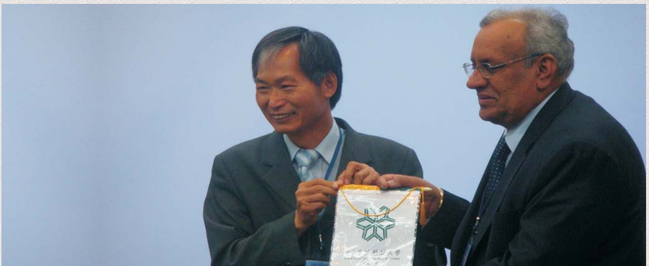
MoU with National Yunlin University of Science and Technology, Taiwan, Republic of China