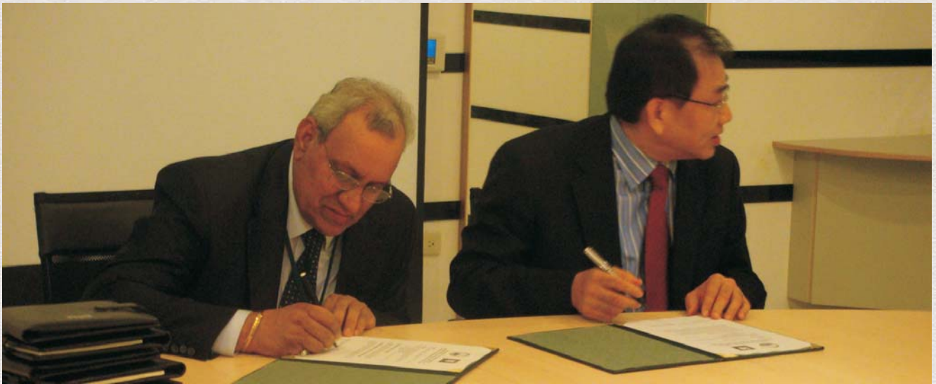
MoU with Overseas Chinese Institute of Technology, Taiwan