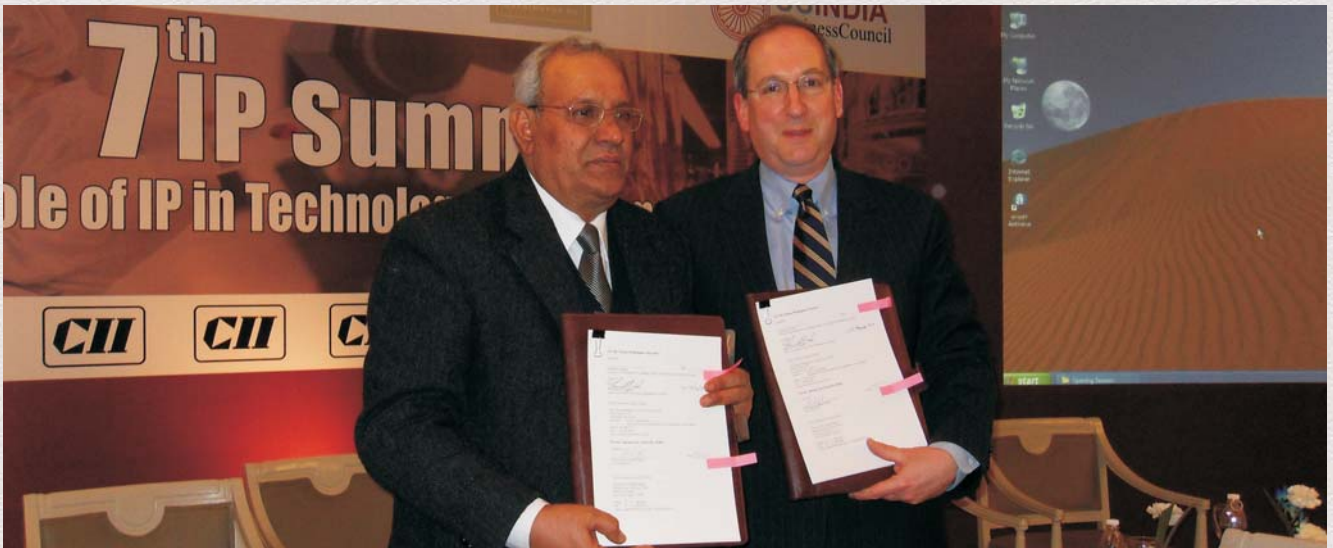
MoU with George Washington University Law School, USA