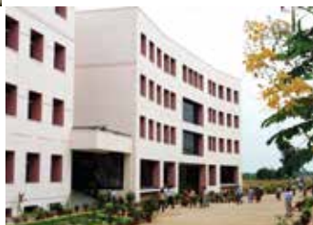
The ICFAI University, Tripura