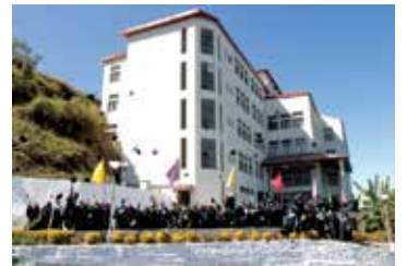
The ICFAI University, Mizoram