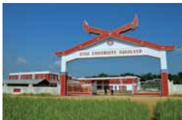
The ICFAI University, Nagaland