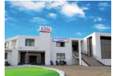
The ICFAI University, Jharkhand