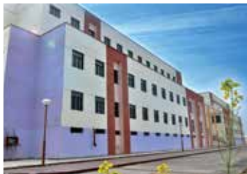
The ICFAI University, Himachal Pradesh (Baddi)