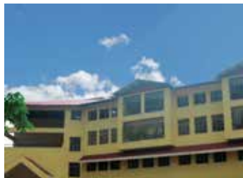
The ICFAI University, Meghalaya