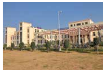
The ICFAI University, Jaipur