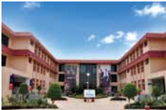
The ICFAI University, Dehradun