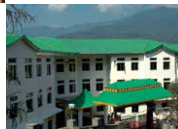
The ICFAI University, Sikkim