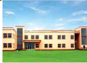
The ICFAI University, Raipur