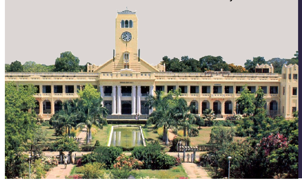
For details visit www.annamalaiuniversity.ac.in

Established in 1929, Annamalai University, accredited with 'A' Grade by NAAC in 2014, is one of India's largest public residential universities with Ten Faculties and 49 departments of study. The University has initiated several innovative teaching programmes over the years and has been a pioneer in distance education. Annamalai University has a commendable track record in projects and publications and has been awarded the PURSE Programme by the Department of Science and Technology. Nineteen departments are supported by UGC-SAP, Sixteen by DST-FIST and two departments have attained the status of Centre of Advanced Study. The University has been rated Seventeenth in the country among the Top 100 institutions of Higher Education and Second in the State by SCImago Institutional Ratings. Annamalai University has joint research and innovation partnerships with 24 institutions across the USA, Europe, Australia, Japan, and the UK. The list of partners include prestigious institutes like Karolinska Institute, John Hopkins University, and University of Michigan amongst others. Two of the most notable international collaborations in which Annamalai University is the Co-ordinating Institute include the Indo-EU FUNCFOOD Project and the 21st Century Indo-US Knowledge Initiative. There are several ongoing research projects with international foundations and industrial players like Bayer, CavinKare, Dow Agrosciences, Bill & Melinda Gates Foundation, HCL, L&T, Accenture, and Huawei.